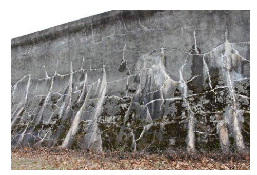
Where was this photo taken?