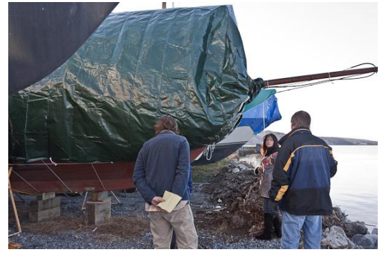
Maintenance brain-trust meets to review survey findings

Jan 21<sup>st</sup> Feb. 18<sup>th</sup> Mar. 18<sup>th</sup> Apr. 15<sup>th</sup> May 20<sup>th</sup>